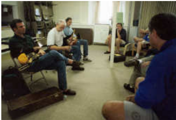
At the North Hero Pipers Gathering, Vermont