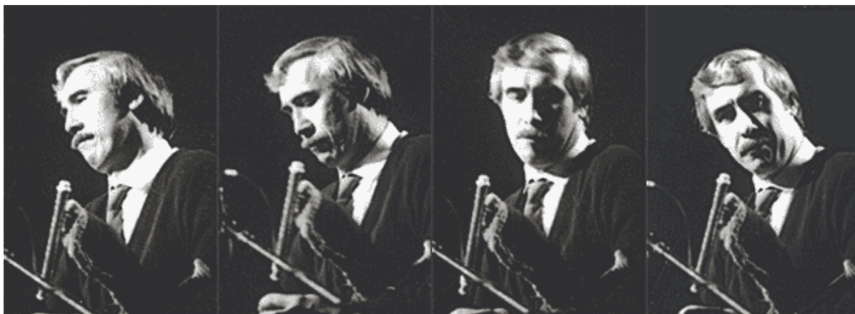
WDET Celtic Fest , 1979